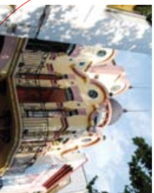
← House by Renard