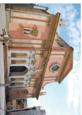
← The church of the Mare de Deu de les Neus