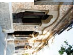
← Can Pahissa house