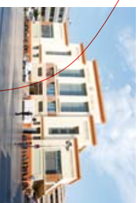
← Central Municipal Market