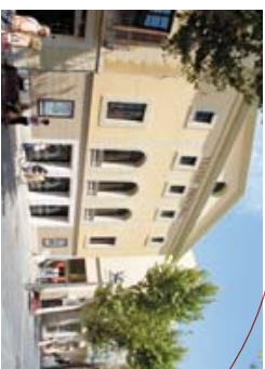
← Principal Theatre