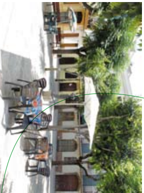
3 ↓ Plaça dels Lledoners

Continuing on until you arrive at the crossroads of Carrer del Ravalet with Carrer dels Aren-gaders (4) , both go round the old wall leading down to la Geltrú castle (5) , reconstructed over the old medieval castle foundations and currently occupied by the Regional Historic Archives. The church of Santa Maria de la Geltrú (6) which safeguards a beautiful polychrome wooden altarpiece dedicated to the Virgin's Assumption, dated 17th century, with decorative Baroque pieces.