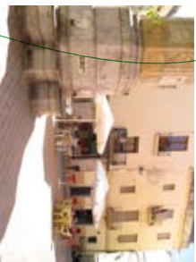
2 ↓ Plaça de Miró de Montgròs