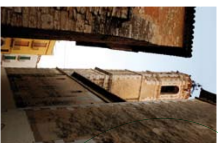
6 ↓ The church of Santa Maria de la Geltrú

Continuing on until you arrive at the crossroads of Carrer del Ravalet with Carrer dels Aren-gaders (4) , both go round the old wall leading down to la Geltrú castle (5) , reconstructed over the old medieval castle foundations and currently occupied by the Regional Historic Archives. The church of Santa Maria de la Geltrú (6) which safeguards a beautiful polychrome wooden altarpiece dedicated to the Virgin's Assumption, dated 17th century, with decorative Baroque pieces.