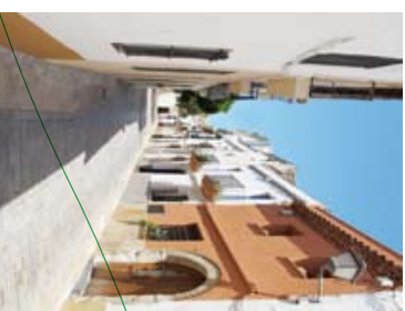
4 ↓ Carrer dels Aren-gaders