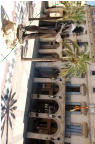
1 ↓ Plaça de la Vila

Further on down Carrer del Bonaire, is the house called "Del Bosser", (Royal Tax Collector), where, on the façade, you can see the engraving of a sheep with a bag.